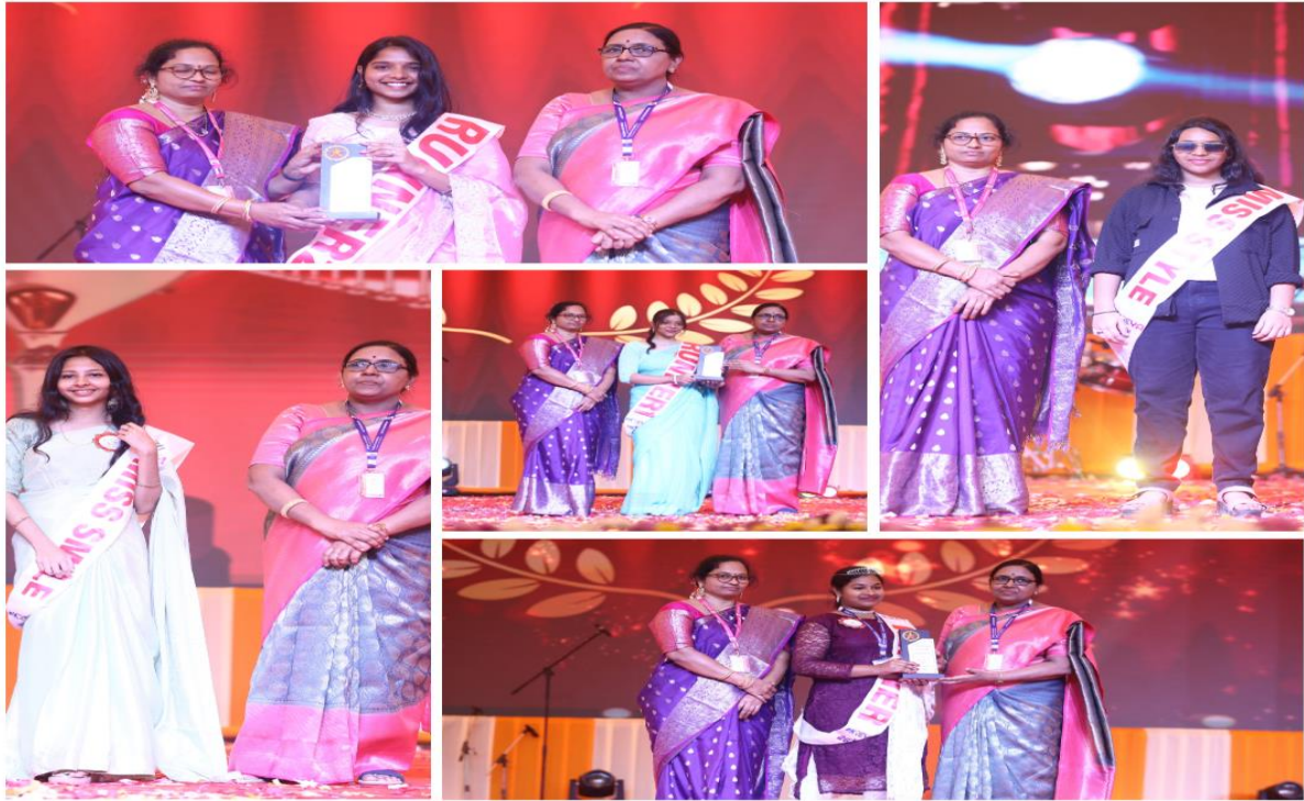
Prize Distribution to the Ms. Kreya 2026 Winners