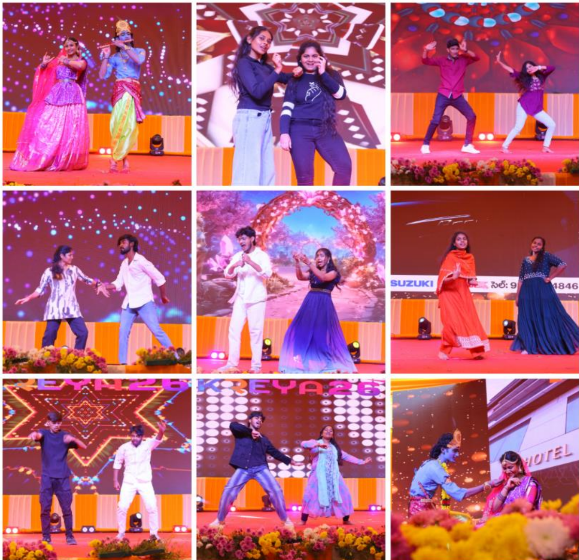
Duet Performances on Day-2 Kreya 2026

Get ready to witness electrifying duet performances where two performers come together in perfect harmony, setting the stage on fire with their flawless synchronization, deep coordination, and vibrant expressions. Their energetic chemistry, rhythmic movements, and powerful stage presence promise to create magical moments that will captivate the audience and fill the venue with unstoppable excitement.