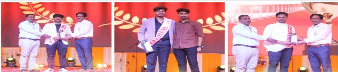
Prize Distribution to the Mr. Kreya Winners and Runners