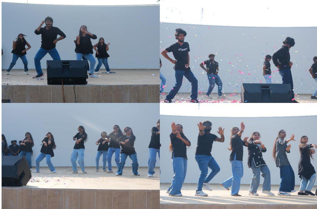
Few Glimpses on “FLASH MOB” Event