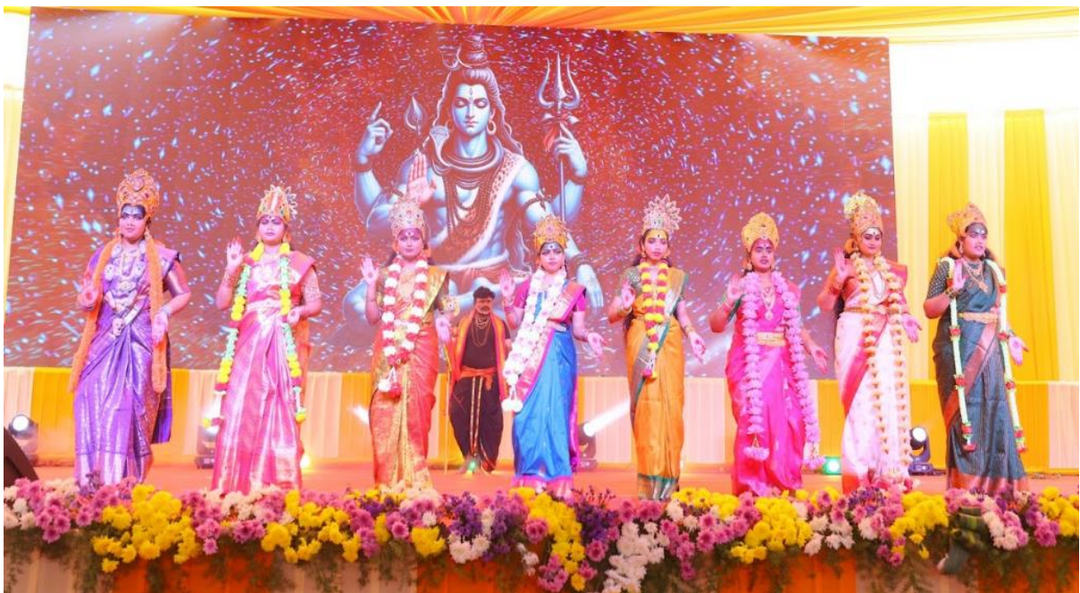
A Special Performance given by students representing Nava Durga's and Lord Shiva