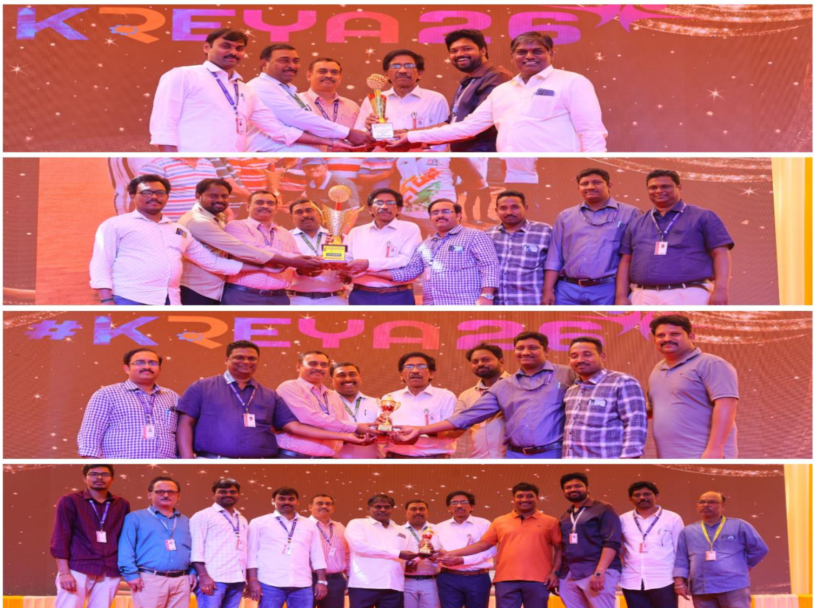
Prize Distribution to Male Faculty Intramural Sports & Games Winners & Runners