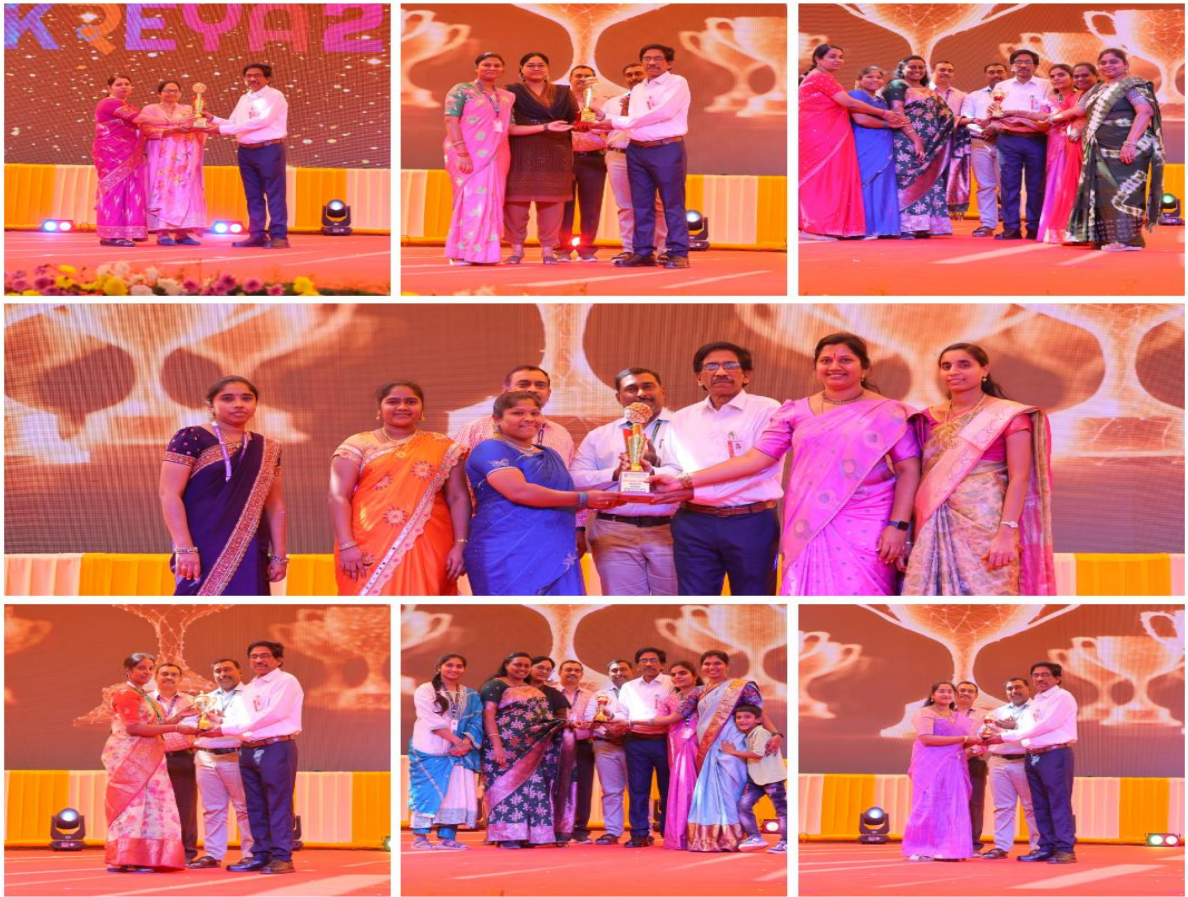
Prize Distribution to Female Faculty Intramural Sports & Games Winners & Runners