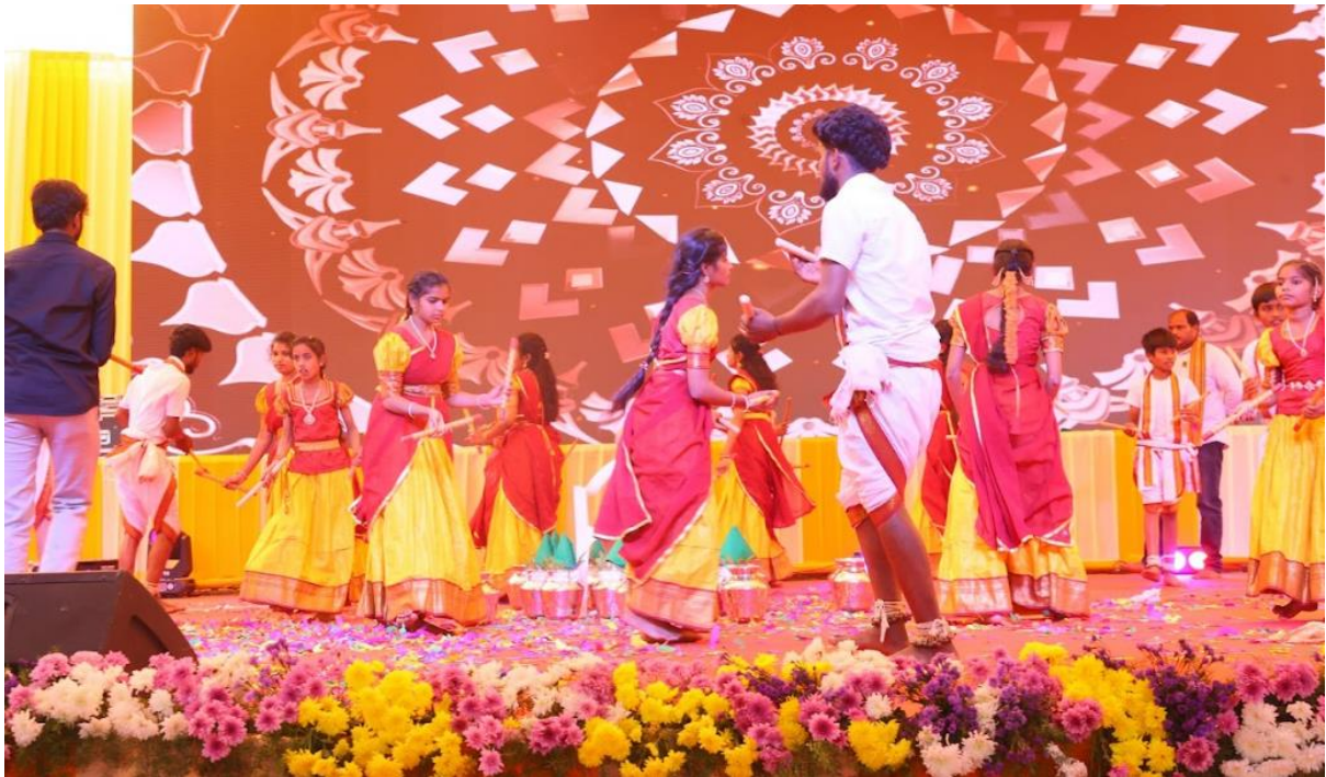
Folk Dance performance by Kolatam Team

soulful ballad, an upbeat pop tune, or a classical opera piece, singing brings people together through the shared experience of music.