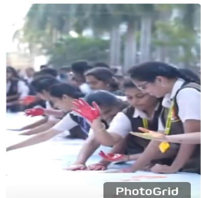
Few Glimpses on Handprints Ceremony of Kreya 2026