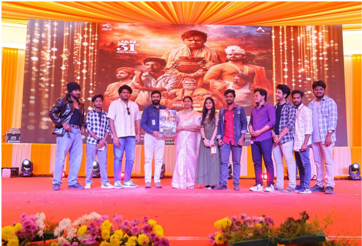
“JATHARA” Team at RCE for Movie Promotion