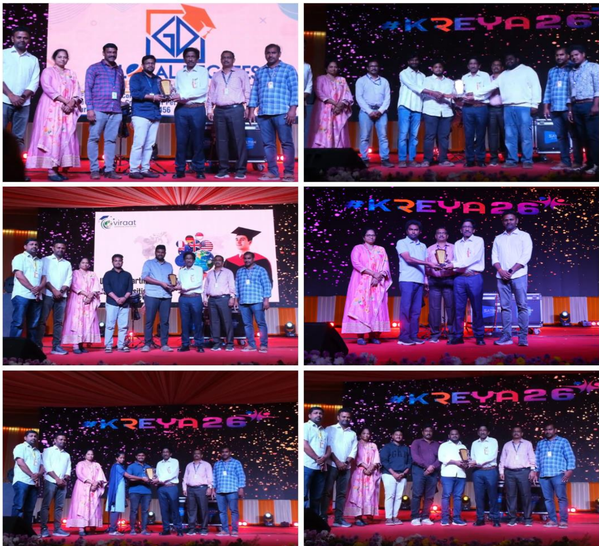
Felicitations to our event Sponsors