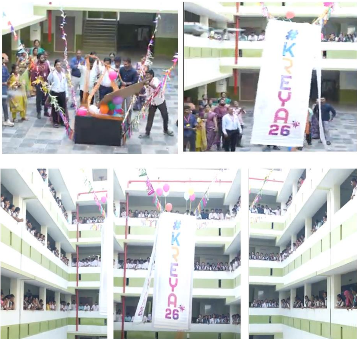
Few Glimpses on Hanging Poster of Kreya 2026 Launching Ceremony

This year as part of Kreya 2026, RCE proudly introduced a new and impactful event titled “Hanging Poster of Kreya 2026 Launching Ceremony.” This creative initiative was organized to officially announce and promote the grand launch of Kreya 2026 while building excitement among students and faculty members.