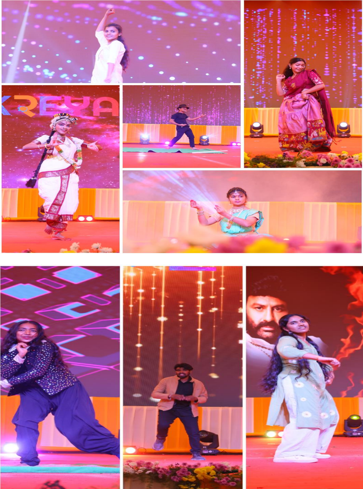
Solo Performances on Day-2 Kreya 2026

As part of Day-2 celebrations of KREYA 2026 at Ramachandra College of Engineering (A), students continued to present their vibrant solo, Duet and group performances showcasing their talent and confidence more energetically than ever before.