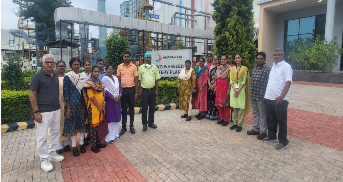
Faculty participants outside the Amara Raja Two-Wheeler Battery Manufacturing Plant, Chittoor

On Day 5 (12 June 2026, Friday), participants visited the Amara Raja Two-Wheeler Battery Manufacturing Plant as part of the afternoon programme. The visit provided an overview of large-scale battery manufacturing for the two-wheeler segment, including a walkthrough of the plant's production infrastructure and an interaction with plant personnel on manufacturing scale, automation levels, and quality assurance practices.