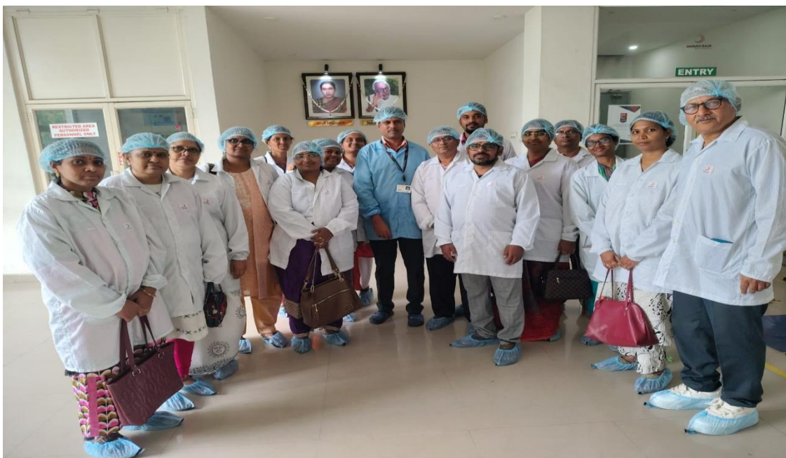
Participants and trainer in ESD-protective lab coats, hair caps, and shoe covers at the entry to the restricted production area, Amara Raja Electronics Limited.