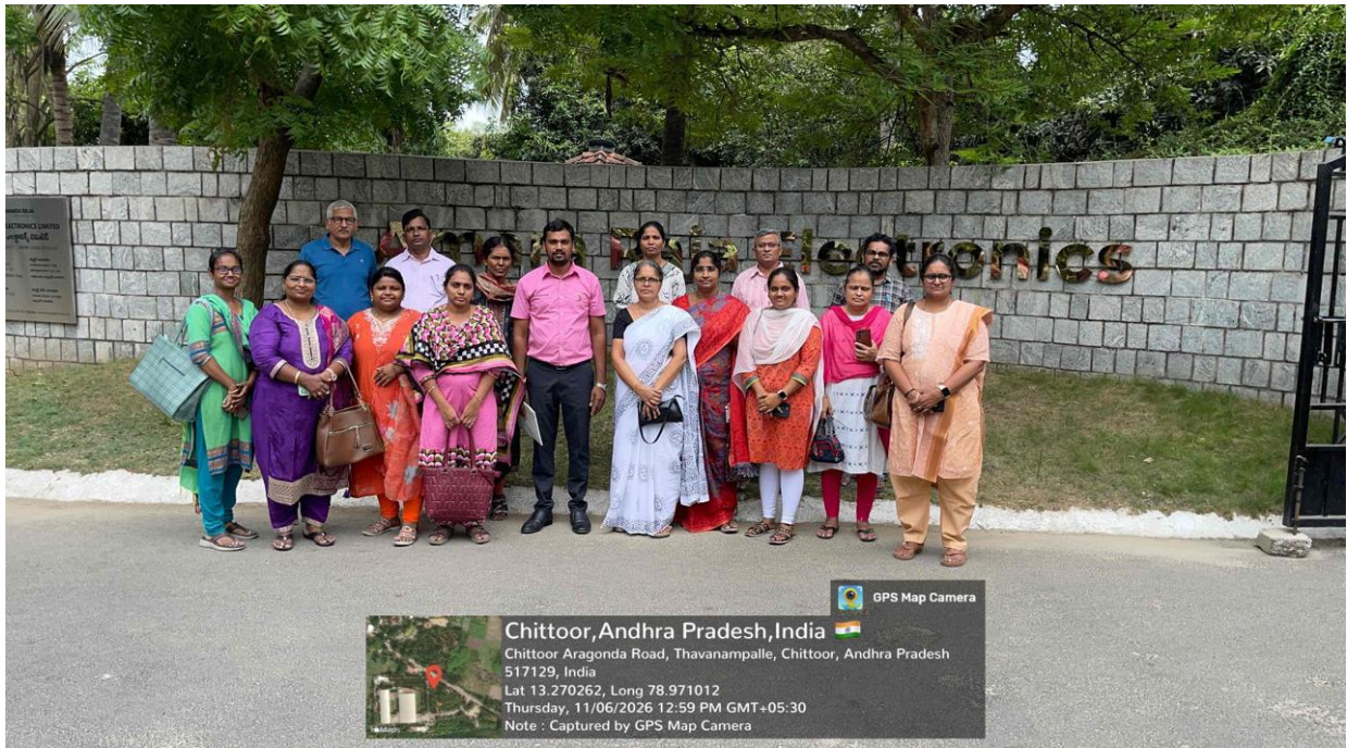
Faculty participants outside Amara Raja Electronics Limited, Chittoor, prior to the plant tour

On Day 4 (11 June 2026, Thursday), following the morning's hands-on session at the ARSDC campus, participants travelled to Amara Raja Electronics Limited for an afternoon industrial visit. After being received at the company premises, the group proceeded toward the production facility. Before entering the restricted manufacturing area, participants and the accompanying faculty trainer donned ESD-protective lab coats, hair caps, and shoe covers in line with the company's electrostatic discharge and hygiene protocols. Inside, participants observed live SMT and PCB assembly operations on the shop floor, relating the screen printing, pick-and-place, and reflow processes studied earlier in the week to an actual industrial production line.