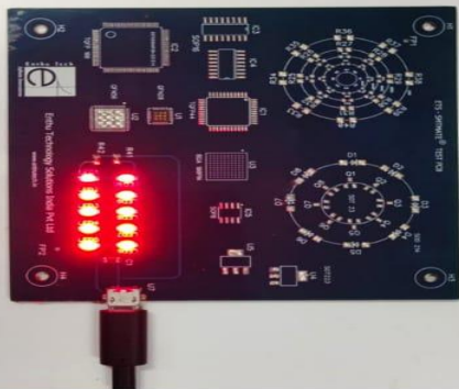
7XFC+VH8, Diguvamagham, Aragonda, Andhra Pradesh 517129, India, Lat:13.2760843,Long:13.2760843